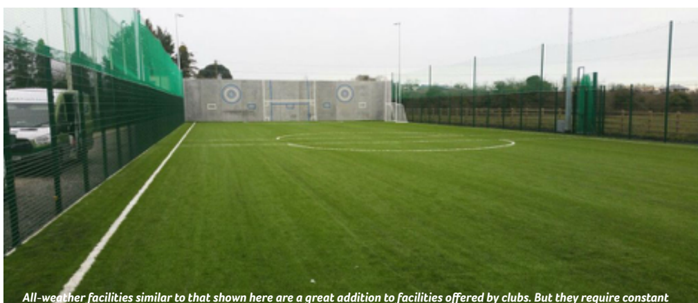
All-weather facilities similar to that shown here are a great addition to facilities offered by clubs. But they require constant care and attention just like a natural playing surface.

he success of a Wicklow GAA club at defending themselves in a court case over an alleged serious injury suffered on their all-weather pitch have been hailed for their exemplary record.