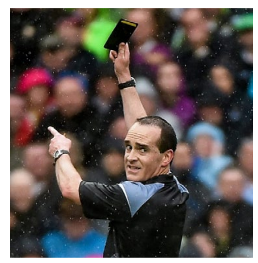
Proposal (5) Kick-Out/Zoning

The Duties of a Referee and Sideline Official to be amended in accordance with this Proposal. Penalty: